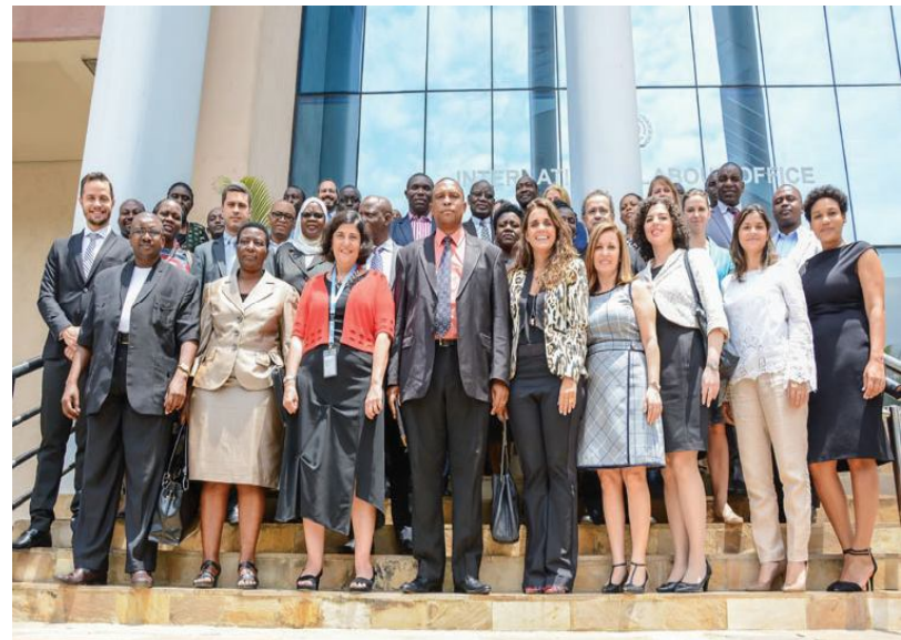
Dar es Salaam (ILO NEWS) - The International Labor Organization (ILO), Brazil and Tanzania organized a South-South Cooperation workshop to develop a project workplan on Decent work in the cotton sector in Tanzania from 14-18 November in Dar es Salaam.

ILO supports South-South Cooperation to promote decent work in the cotton sector in Tanzania. The ILO, Brazil and Tanzania teamed up to share experiences and best practices to enhance the national capacity to better respond to challenges in the cotton sector. South-South Cooperation initiative strengthens cooperation