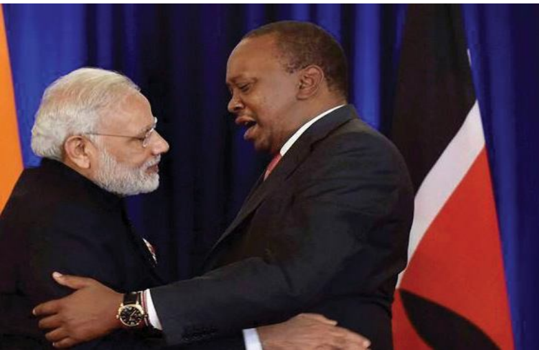
In response to Kenya's request to develop Kenya's film industry, India offered to consider deputation of Indian faculty to the School of Film Making in Nairobi.