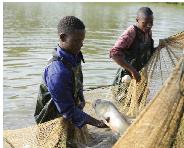
Developing aquaculture value chains is one of the main focus areas of Phase III of the project

Developed Country beneficiary nation for a SSC project to be implemented under the FAO-China SSC Programme. The first two phases – focused on crop and animal production – yielded dramatic results, including a quadrupling of rice production per hectare in the project areas, as well as increased milk production. This marked a break with years of low productivity, affecting the food security and livelihoods of more than 70 percent of Ugandans who depend on subsistence agriculture.